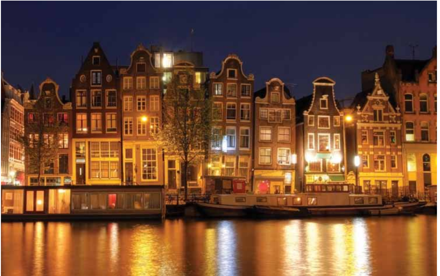
Begin your cruise in the vibrant canal-crossed city of Amsterdam